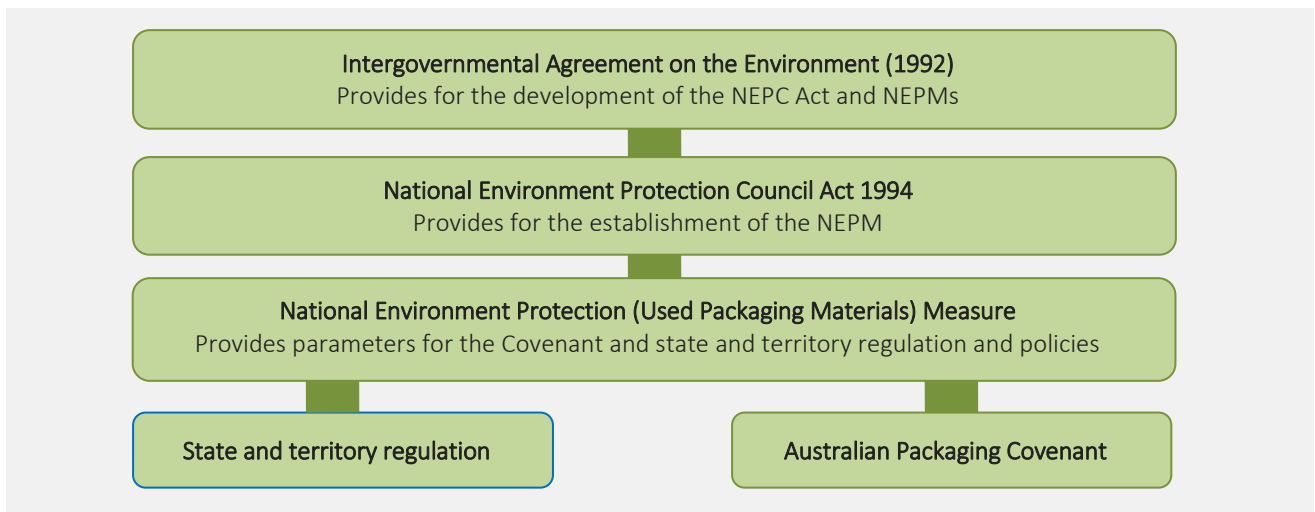
Figure 1 Legislative framework for the Australian Packaging Covenant

The Agreement forms the basis for the development of the National Environment Protection Council Act 1994 . This Act contains provisions to enable the National Environment Protection Council, consisting of commonwealth and state and territory environment ministers, to develop National Environment Protection Measures for the re-use and recycling of used materials. 3